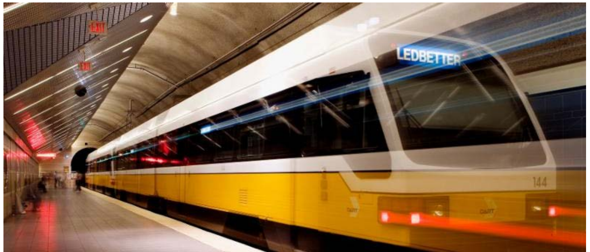
DART Light Rail

Denton. Experience a community gathering space alive with music, local food and produce, locally produced handmade arts and crafts, on-site food, local business, community groups, and more. The market is held 9 am to 1 pm and is located at Carroll Blvd. and Mulberry St. More information at, dentonmarket.org . Available via DCTA A-Train to Downtown Denton Transit Center. Walk to the market or board DCTA Connect Route 7, then take a short walk to the market. Last A-train service from Downtown Denton Transit Center to DART Trinity Mills Station is 11:53 pm Saturdays. No A-train service on Sundays.